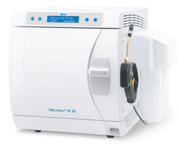
MELAdem®40 mounted on the Vacuklav® 31 B+

Operating the autoclaves should be both pleasurable and safe. The design fully supports this demand. It shows what's essential, and does its work efficiently. The large door lock is not only a design feature, but also ensures a safe and easy opening and closing of the door.