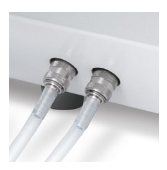
quick release connector

The large integrated funnel-shaped opening of the water storage tank makes it easy to fill the tank with demineralized or distilled water in the Vacuklav® 31 B+ and Vacuklav® 23 B+. Alternatively, both autoclaves could be fed the required water supply from any external reserve container or even be connected to a water treatment unit.